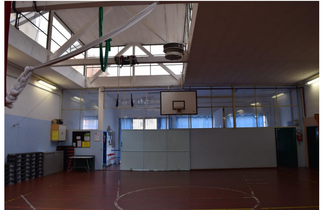
ATC gym in Bologna, Emilia-Romagna