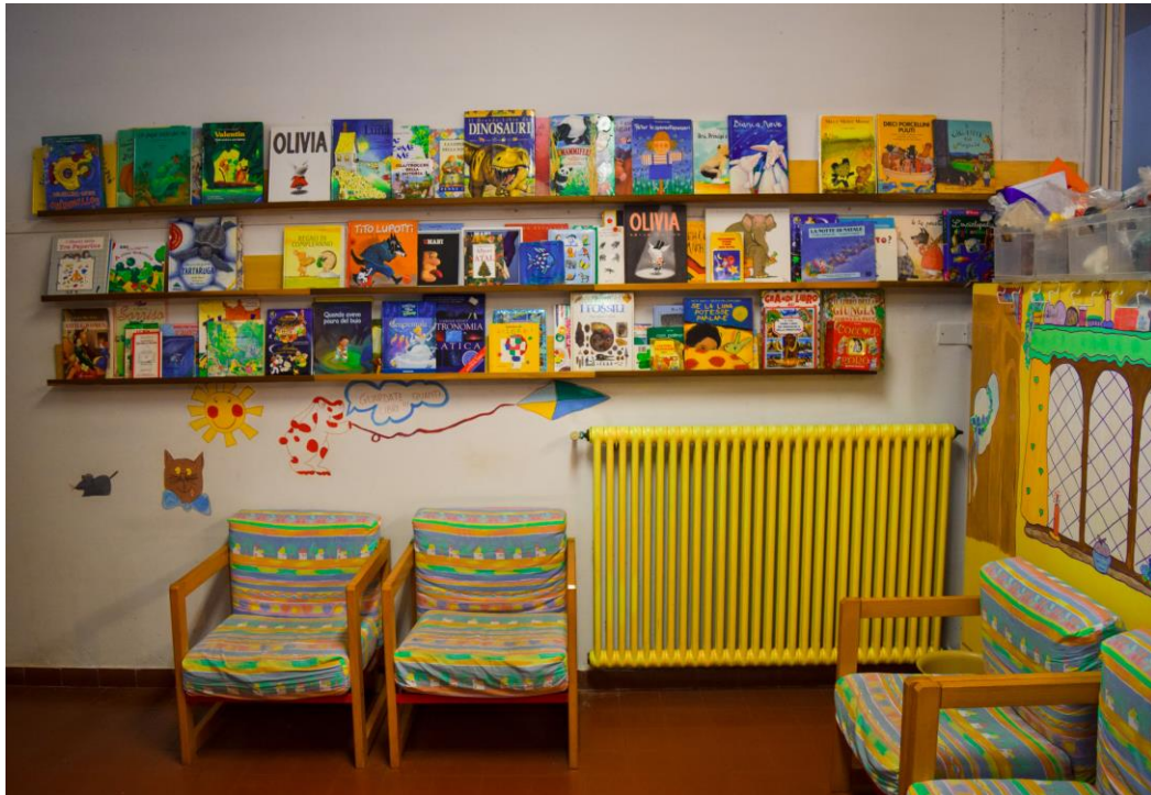
Ludoteca in Bologna, Emilia-Romagna

AICS also holds numerous facilities such as gyms, sport stations, swimming pools, libraries, cinemas, hotels and theaters